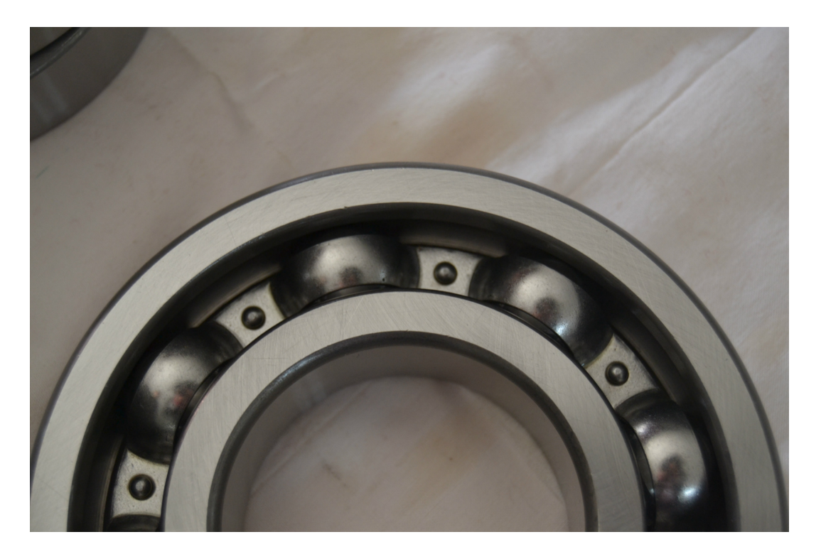
(2) is the production of BSM354126AJ bearing a commodity classify the input factors of production, can be divided into labor-intensive products and capital-intensive goods some factors of production such as intensive goods.